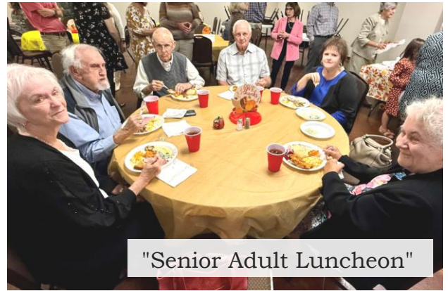
"Senior Adult Luncheon"

"And the angel said unto them, Fear not; for, behold, I bring you good tidings of great joy, which shall be to all people. For unto you is born this day in the city of David a Saviour, which is Christ the Lord." Luke 2:10-11